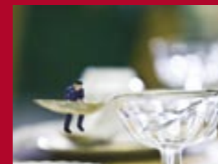
'Excavating Orange Chocolate Deserts'